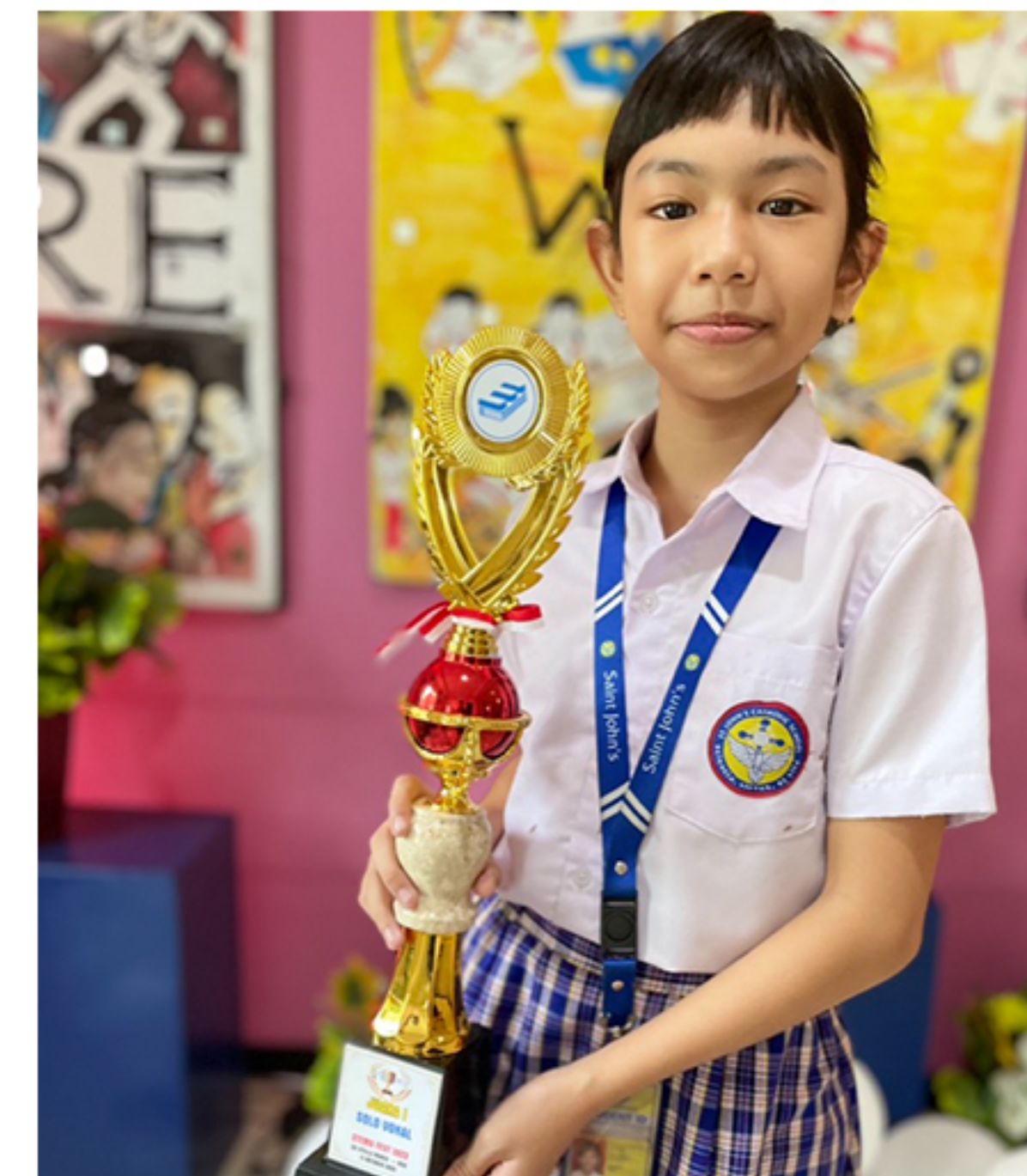
Stema Fest Solo Vocal