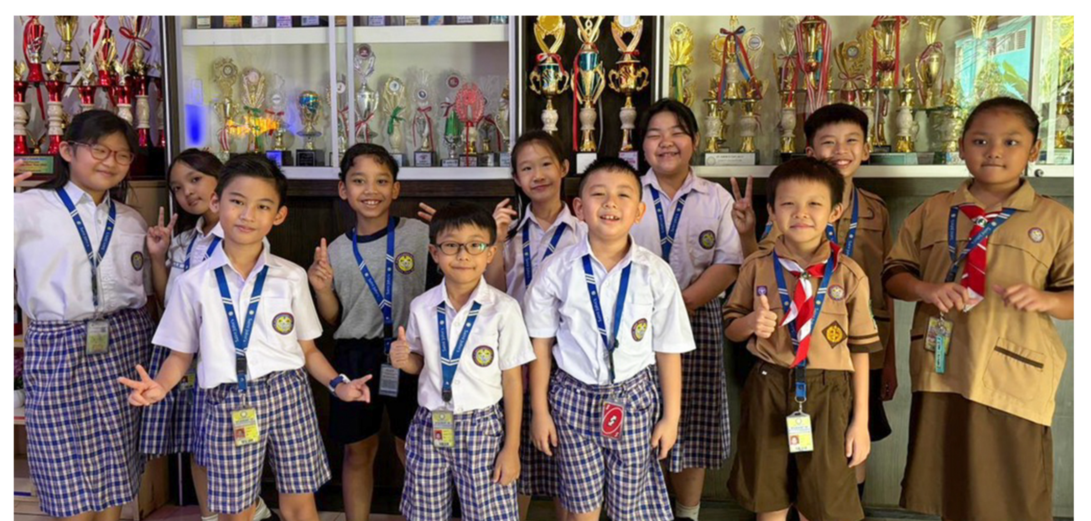
JISMO Mathematics Autumn 2023