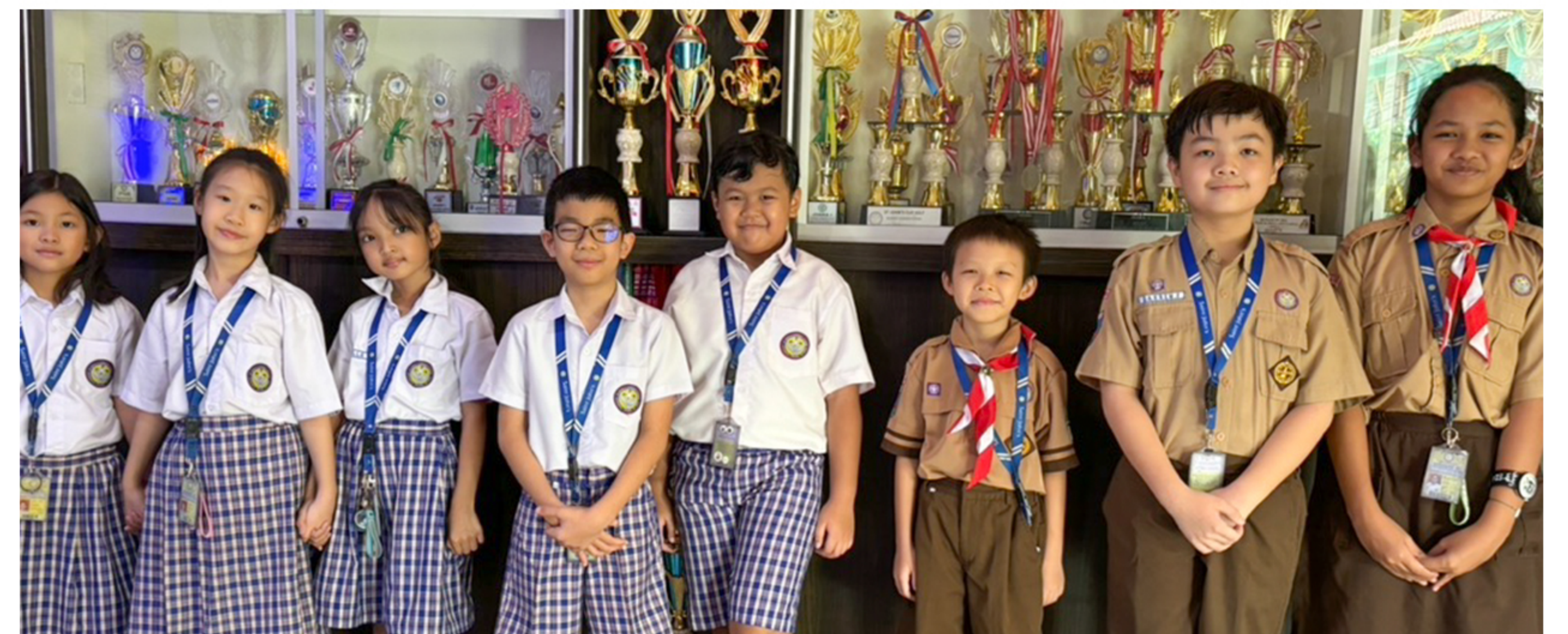
JISMO Science Autumn 2023

Congratulations to all the winners for bringing pride and honor to our school.