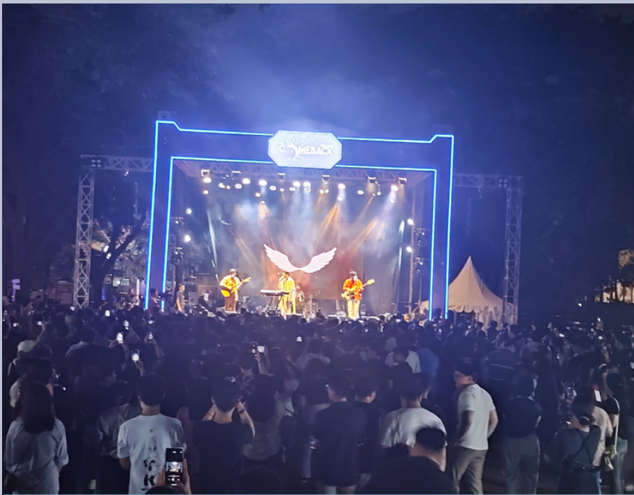
PAGE 7 | SYNC 2023 : THE COMEBACK