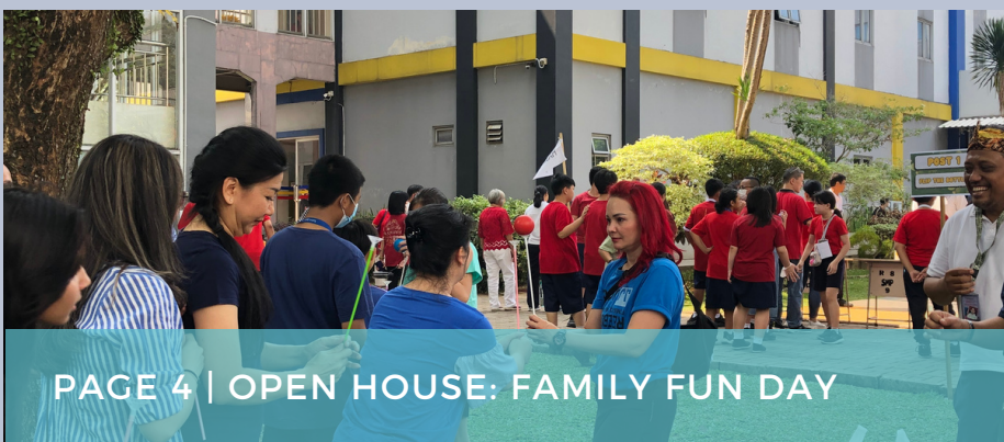
PAGE 4 | OPEN HOUSE: FAMILY FUN DAY