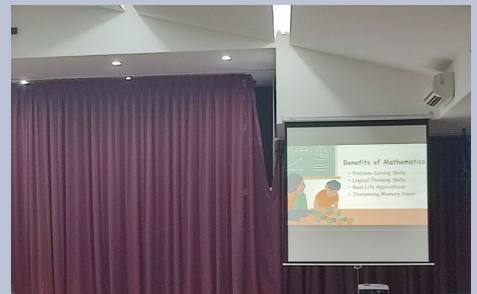
PAGE 3 | MATH ACTIVITY